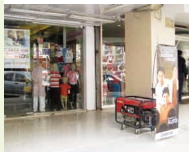
Generator used as a backup power source for a boutique