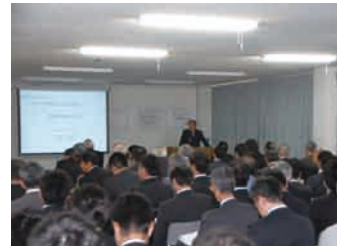
Procurement policy briefings

We also actively cooperate with our suppliers in areas such as quality improvement and cost reduction.