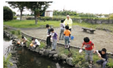
Water quality surveys conducted by local non-profit organizations