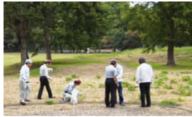
Cleanup activities around the park