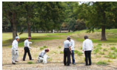
Cleanup activities around the park