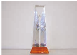
Ota City's plaque recognizing Sawafuji Electric as a company contributing to industrial development

Every year, we work to strengthen our ties with the local community. Our efforts include get-togethers with the people from sheltered workshops, cleaning the area near our factory, and participating in local events.