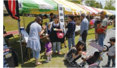
Gunma Interactive Festival