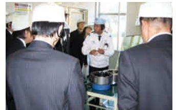
Factory tours during technical lectures

We also held technical lectures to enhance services at these distributors and dealers.