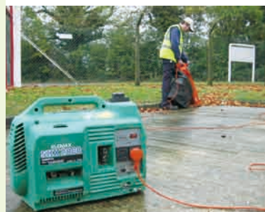
Generator being used for cleaning work