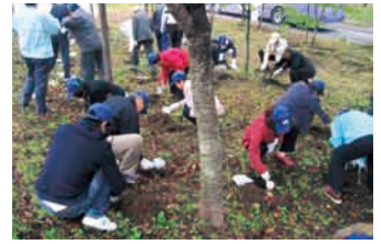
The National Tree-Care Festival