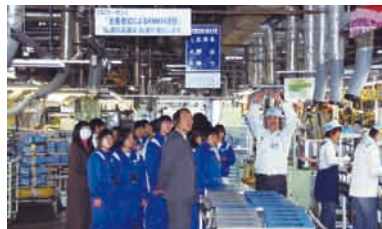
Plant tour for neighborhood schools

Every year, we work to strengthen our ties with the local community. Our efforts include get-togethers with the people from sheltered workshops, cleaning the area near our factory, and participating in local events.