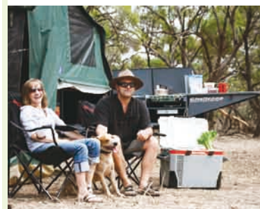
Refrigerator for leisure