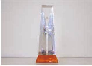
Ota City's plaque recognizing Sawafuji Electric as a company contributing to industrial development

Every year, we work to strengthen our ties with the local community. Our efforts include get-togethers with the people from sheltered workshops, cleaning the area near our factory, and participating in local events.