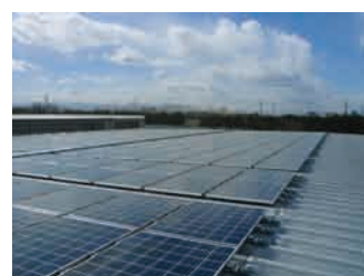
Solar power panels are installed on the roof of our factory

We have compiled the results of our environmental work in a report that is presented as part of our CSR report.