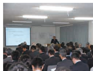
Procurement policy briefings

We also actively cooperate with our suppliers in areas such as quality improvement and cost reduction.