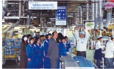
Plant tour for neighborhood schools

Every year, we work to strengthen our ties with the local community. Our efforts include get-togethers with the people from sheltered workshops, cleaning the area near our factory, and participating in local events.