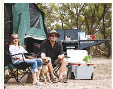
Refrigerator for leisure