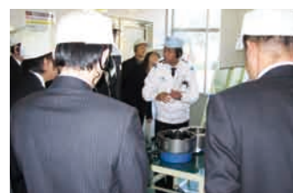
Factory tours during technical lectures

We also held technical lectures to enhance services at these distributors and dealers.