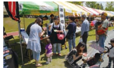
Gunma Interactive Festival