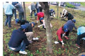
The National Tree-Care Festival