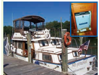
Refrigerator mounted on a pleasure boat