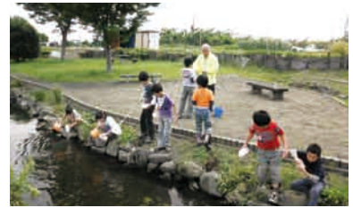
Water quality surveys conducted by local non-profit organizations