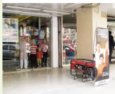
Generator used as a backup power source for a boutique